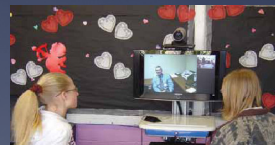
Telehealth in schools